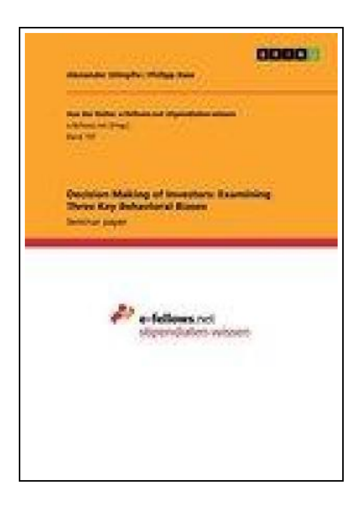
Filesize: 7.12 MB

This book is really gripping and fascinating. I was able to comprehended every little thing out of this published e pdf. Your life span will likely be transform when you full looking at this ebook. (Mrs. Heaven Schmeler)